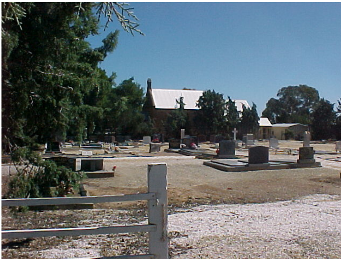
● The One Tree Hill Cemetery

The A delaide N orthern D istricts F amily H istory G roup Inc. with the support of The City of Playford will be holding this year's event on Saturday March 27th 2010 . We meet at 12.30 for 1.00pm start in Williams Road, Hillbank, which is just off Main North Road via Black Top Road. Signs will be posted along the way.